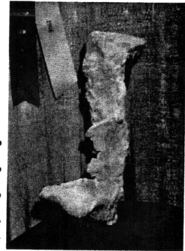
Gold placer nugget “Boot of Cortez”, 11 inches tall, 389.4 ounces Tr., Sonora Desert, Mexico, St. Troy Consolidated Mines, Ltd., 2004 Tucson Show