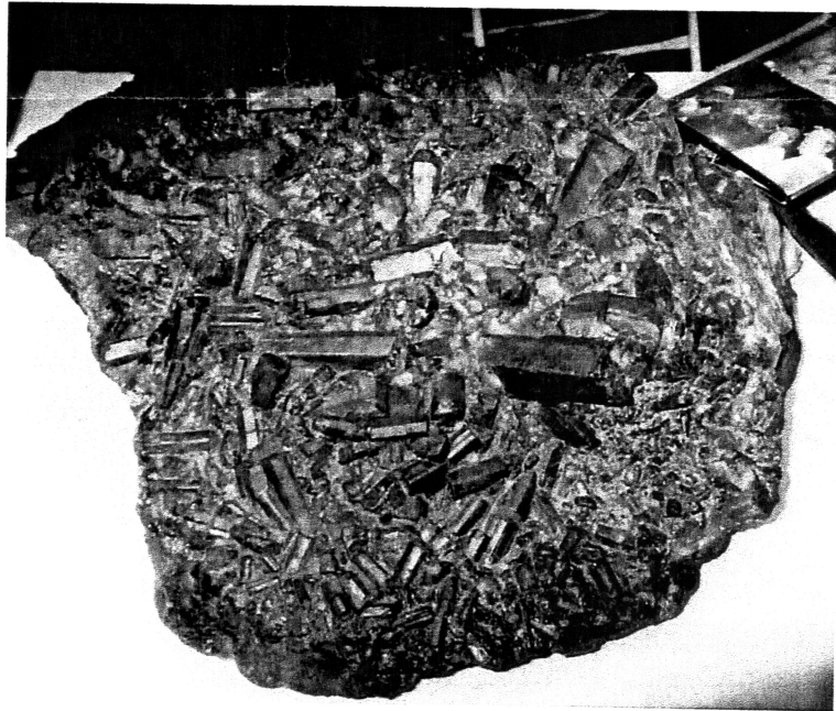
Emerald on matrix, specimen is approx. 21 inches wide, Brazil JP International specimen, 2004 Tucson Show