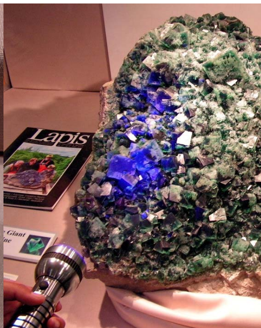
Giant Weardale Fluorite