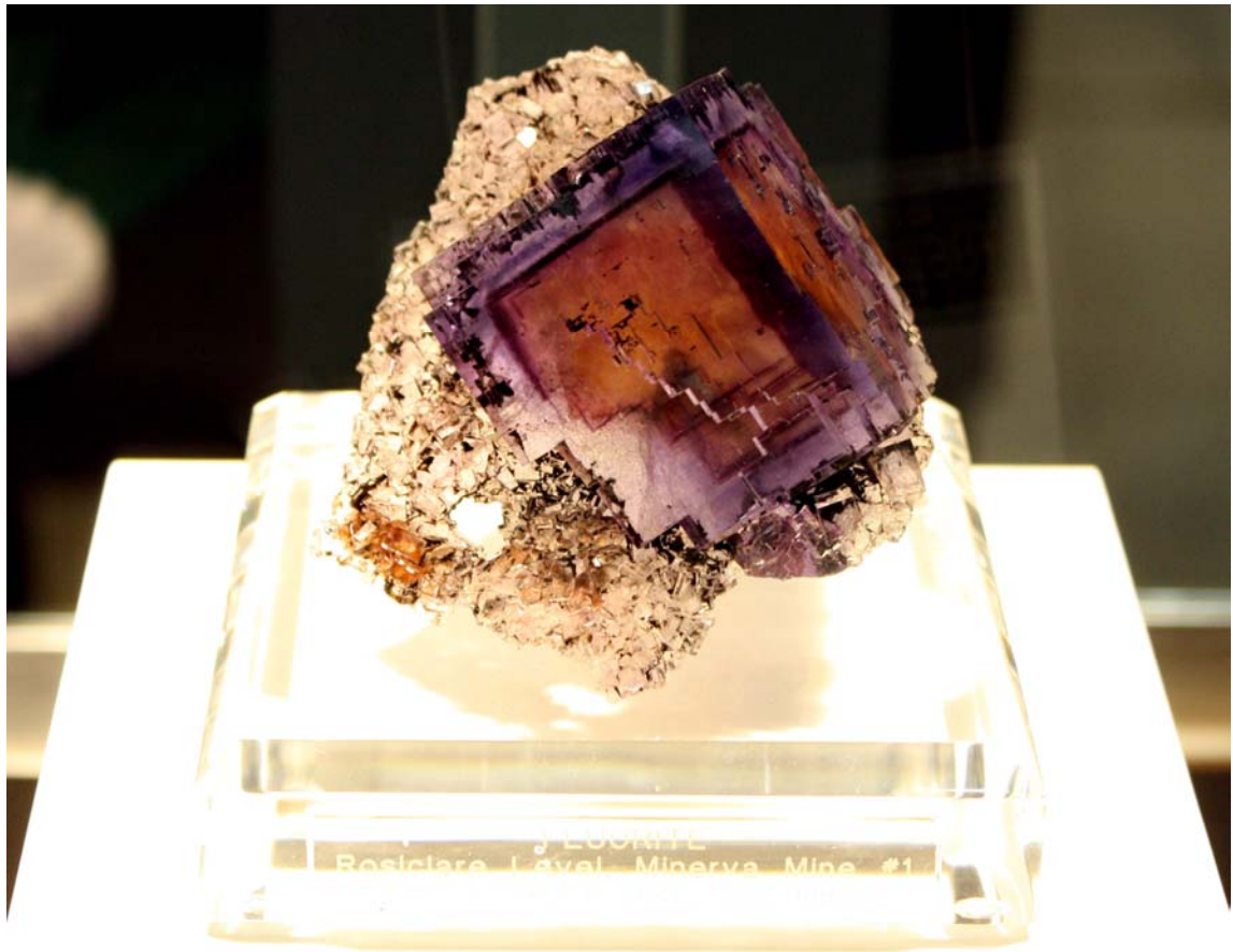
Fluorite on Pyrite