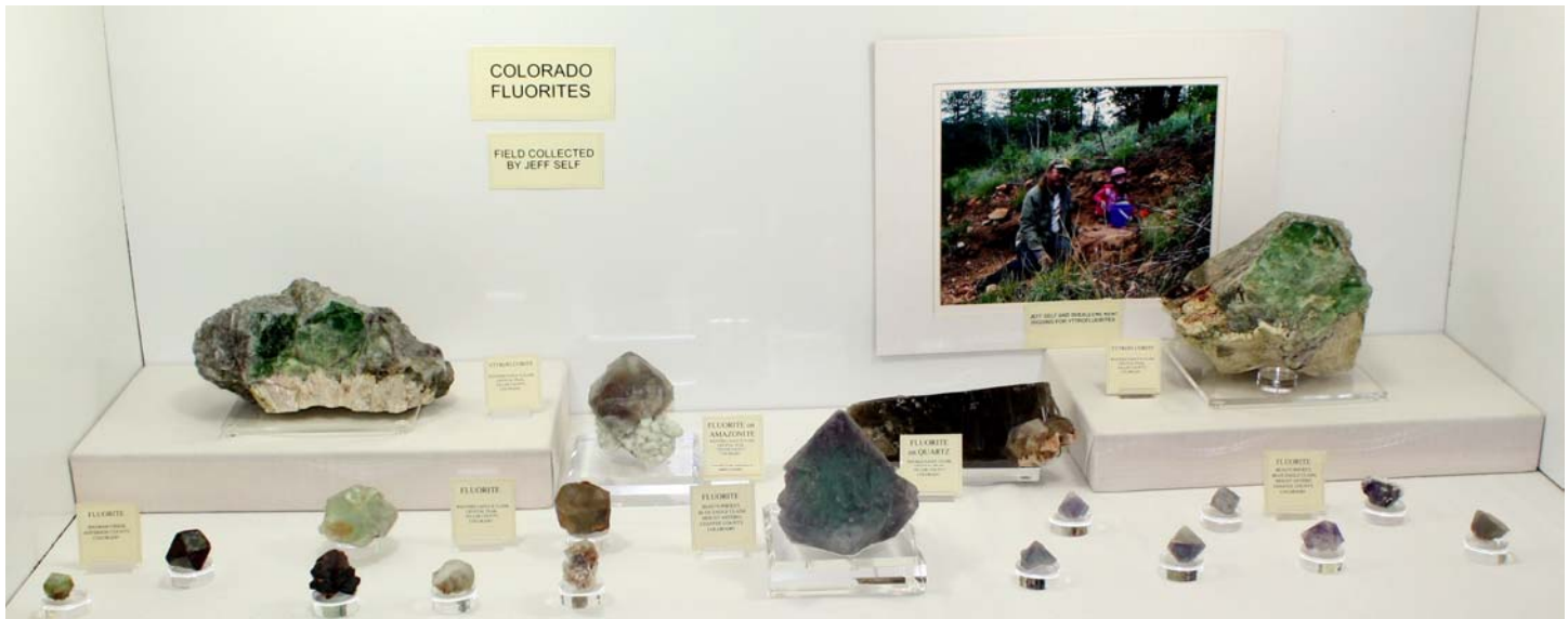
Jeff Self's Colorado Fluorite Display