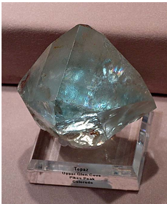
Glen Cove Colorado Topaz