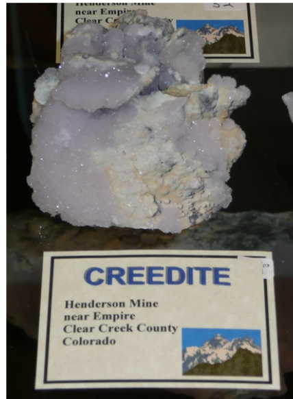
A new 2007 find of Creedite

On the last day a young gentleman walked into Self A Ware with a portable XRF detector, what a toy! We had him hit a few specimens to see what kind of reading he would get and were happy to see my chalcopryrite had over 500ppm Ag (silver) at the point of analysis. All in all a very enjoyable show.